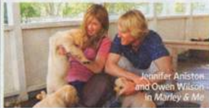
Jennifer Aniston and Owen Wilson in Marley & Me