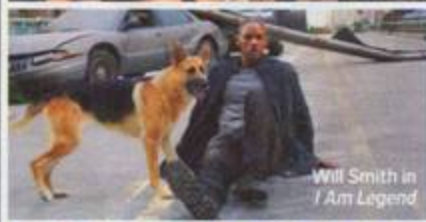
Will Smith in I Am Legend